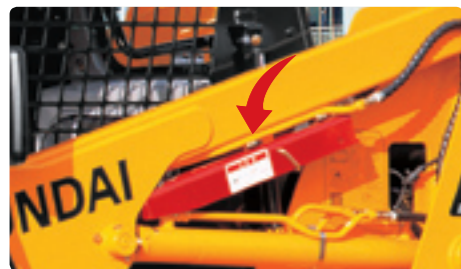
Some of the photos may include optional equipment.