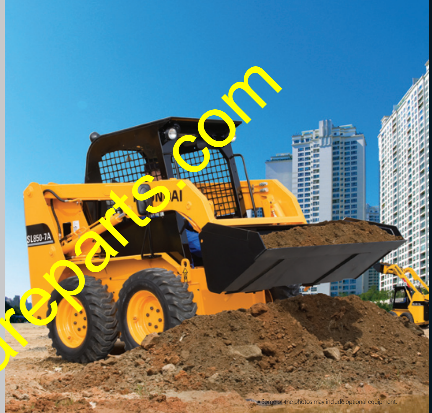
Some of the photos may include optional equipment.

Standard and optional equipment may vary. Contact your Hyundai dealer for more information. The machine may vary according to International standards. The photos may include attachments and optional equipment that are not available in your area. * Materials and specifications are subject to change without advance notice. * All imperial measurements rounded off to the nearest pound or inch.