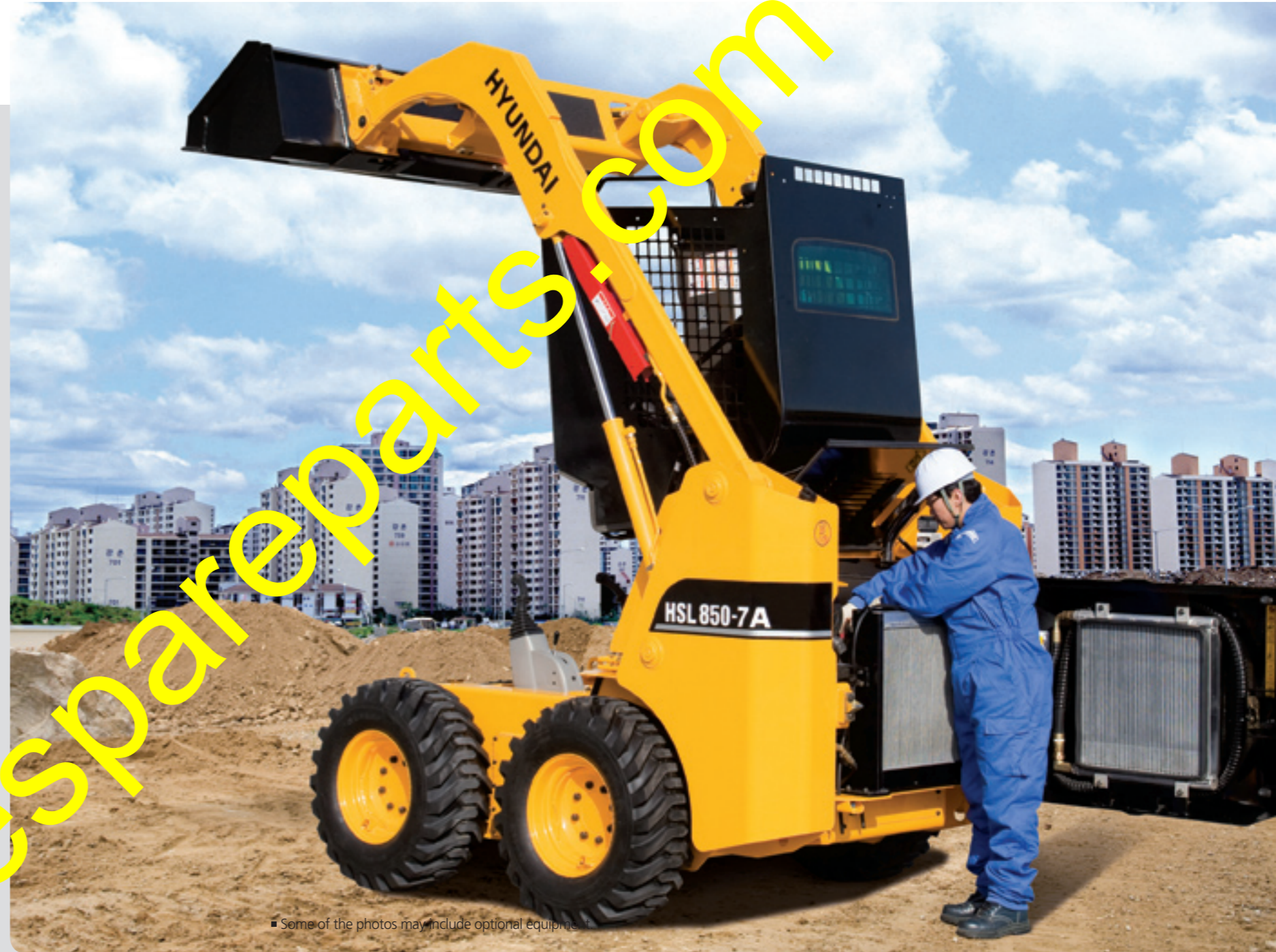
Some of the photos may include optional equipment.

Highly efficient, heavy duty, dual air cleaner provides additional engine protection and improved durability.