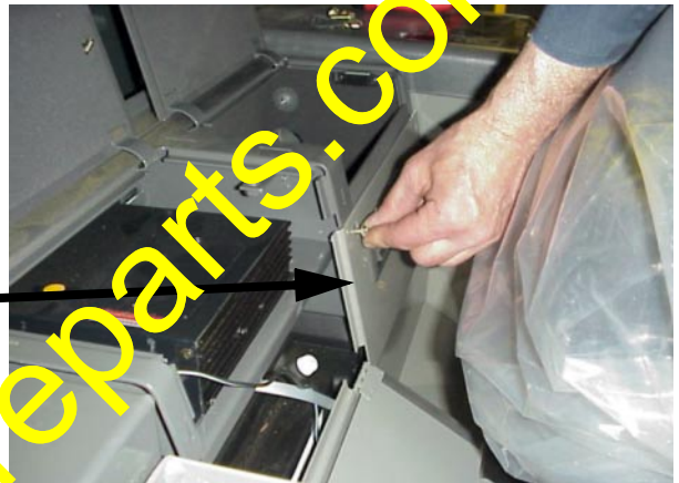
Plate of rear console.

4- Open covers of rear boxes and unscrew bolts to remove.