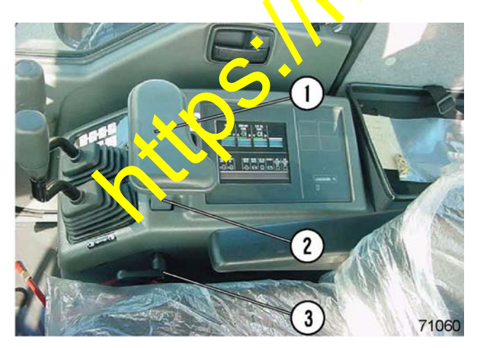
FIGURE 1. PREVIOUS WRIST REST 1. Pad 3. Adjustment Lever 2. Mounting Bracket

A larger sized wrist rest is now available to provide increased operator comfort. In addition to the larger size, the cover material has been changed to a more durable woven fabric. Refer to Figures 1 & 2 for the difference in size. Refer to Table 1 for z complete listing of the kit contents.